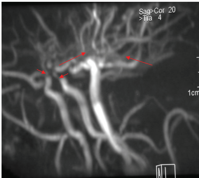
Fig. 1. Magnetic resonance angiogram of the brain, lateral view demonstrates stenosis around The circle of Willis (short arrows) with development of collateral vessels (long arrows), which is a classic of Moyamoya disease.

antibodies, anti-DNA titres, Anti-cardiolipin antibodies (ACA), alpha fetoprotein, echocardiogram and blood film. All were within normal limits. The electroencephalogram showed sharp activity over the left frontotemporal area that spread to the right side occasionally. Cranial Magnetic Resonance Imaging Scan (MRI) revealed right frontal and occipital region encephalomalacia (loss of brain tissues), which may indicate old ischemic stroke. It also showed flow void appearance around the basal ganglia. Further evaluation by magnetic resonance angiography demonstrated collateral channels at the base of the brain with stenosis of the arteries around circle of Willis, which is typical of Moyamoya disease (Fig. 1 and 2). The following laboratory tests were done to rule out any other possible causes of ischemic stroke: Protein C and S, homocysteine, anti-thrombin III level, Factor IV Leiden mutation, and sickle cell screen, all were within normal limits.